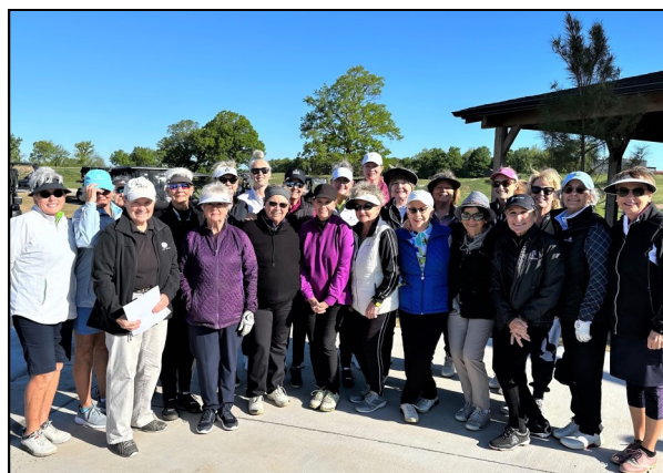
May Day was a fabulous day on The Battlefield as 9-hole and 18-hole SLWGA players joined forces and competed in a 4-person mixed scramble.