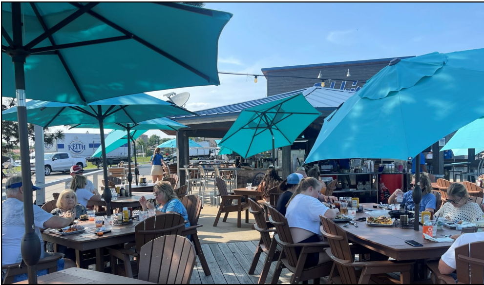
Eddy's Lakeside Bar is officially open for the 2023 season – open Friday-Sunday weekly.

Ten! That's the number of dining and drinking venues on the Shangri-La Resort property. All eleven venues are now open, including The Summit, Buffalo Bar, Doc's Bar & Grill, Eddy's Lakeside Bar, The Galley at The Anchor, the Sports Bar at The Anchor, The Monkey Grind, the Pool Bar, the Turn House at the main clubhouse, and The Canteen at The Battlefield. If you can't find an atmosphere and menu that fits your mood and your appetite at Shangri-La, you must not be trying.