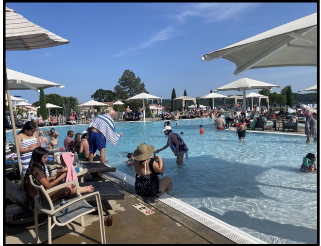
Memorial weekend traditionally starts the "pool season" in Oklahoma – and guests at Shangri-La Resort certainly took the tradition seriously.