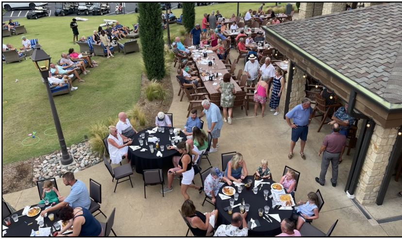
The Thursday Night Shrimp Boil & Karaoke on Doc's Patio is a popular event for members and guests alike!

If you haven't been to Doc's Bar & Grill in the last week or so, you haven't had a chance to experience some great new offerings and the return of some long-time favorites on our new menu at Doc's.