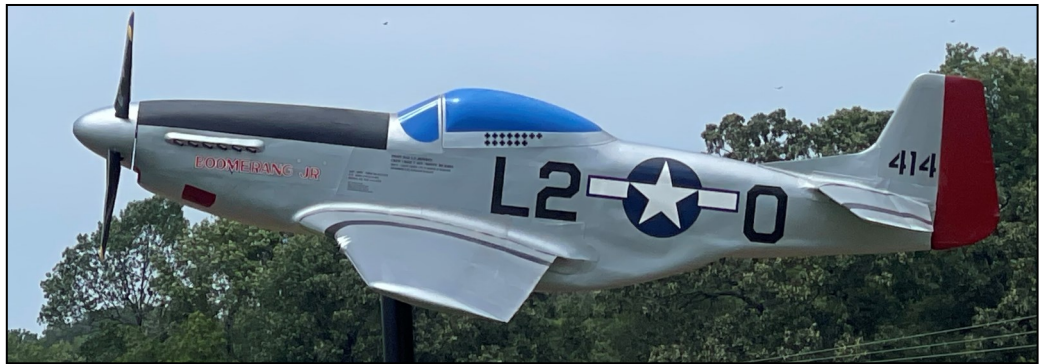
A replica P-51 Mustang fighter has been added to the WW II commemorative collection at Shangri-La. It is on display across from Monkey Island's Grand Lake Regional Airport adjacent to The Battlefield Par 3 Golf Course.