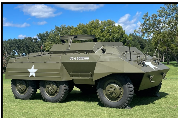
Check out the latest addition to our collection of WWII memorabilia honoring "The Greatest Generation." This authentic armored personnel carrier arrived on campus last month.