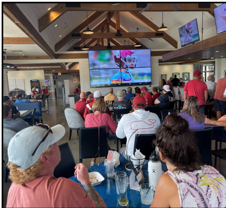
It's FOOTBALL SEASON at The Anchor!