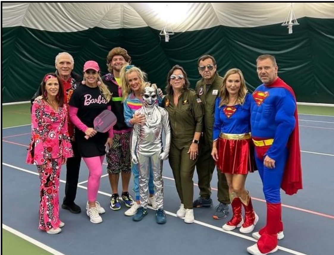
Halloween fun isn't just for kids. The Racquet Club Halloween Costume Mixer was all about the big kids!