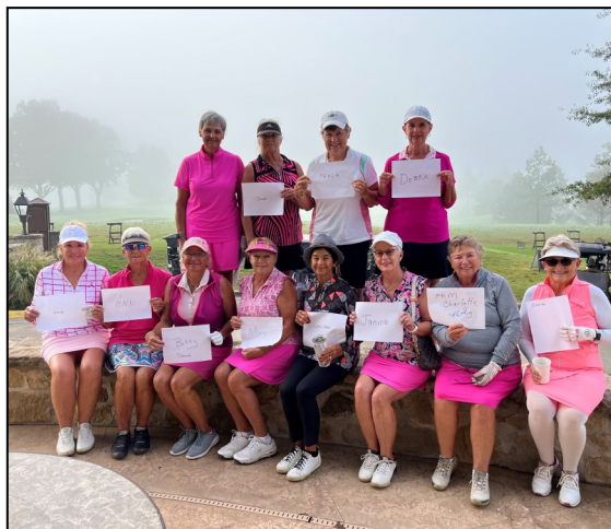
"Pretty in Pink!" SLWGA 18-hole players honored friends or family members battling cancer as they recently golfed for the cure.