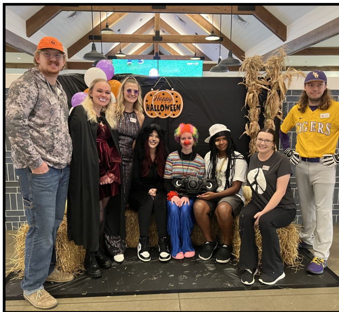
The Anchor crew was dressed and ready for the arrival of a record number of ghouls & goblins at the 2023 Anchor Halloween Party.