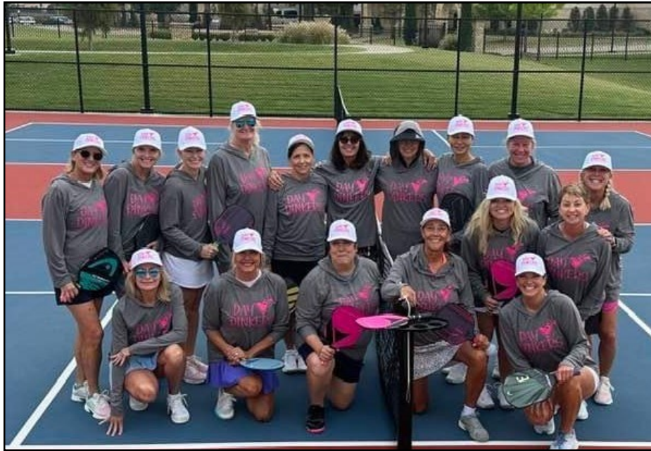
We had a great turnout of “Lady Day Dinkers” for our inaugural two-day Pickleball Camp.