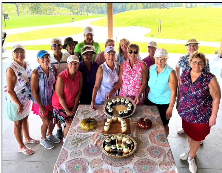
SLWGA members recently joined forces to take on The Battlefield as the 2023 season will soon come to an end.

"Golf is the closest game to the game we call life. You get bad breaks from good shots; you get good breaks from bad shots—but you have to play the ball where it lies." Bobby Jones