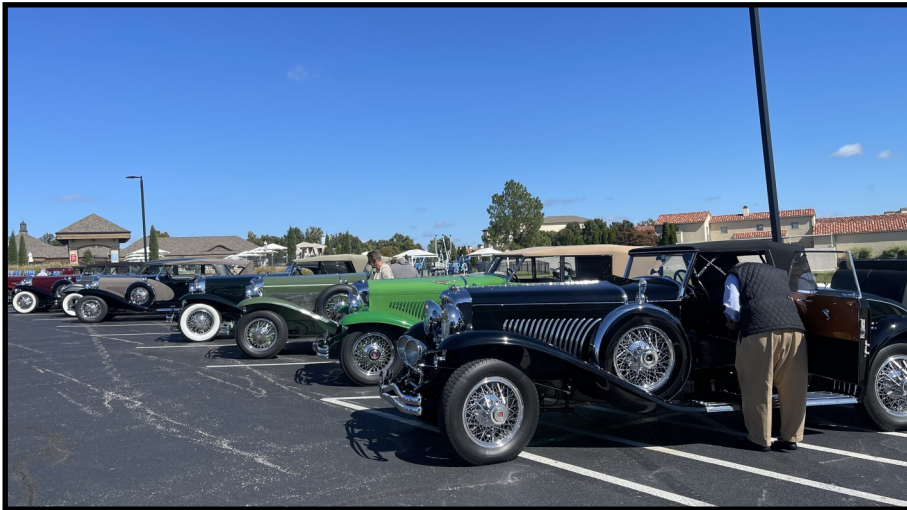
You never know what you might see at Shangri-La – like a collection of beautiful classic Duesenberg automobiles that accompanied a Duesenberg owners' group meeting at the resort.