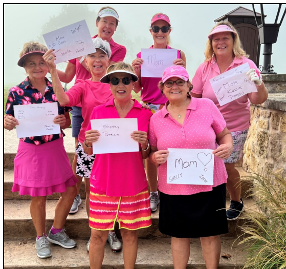
No, it's not a Barbie Party! Golfing for the cure and honoring friends and family members battling cancer are some SLWGA 9-hole players.