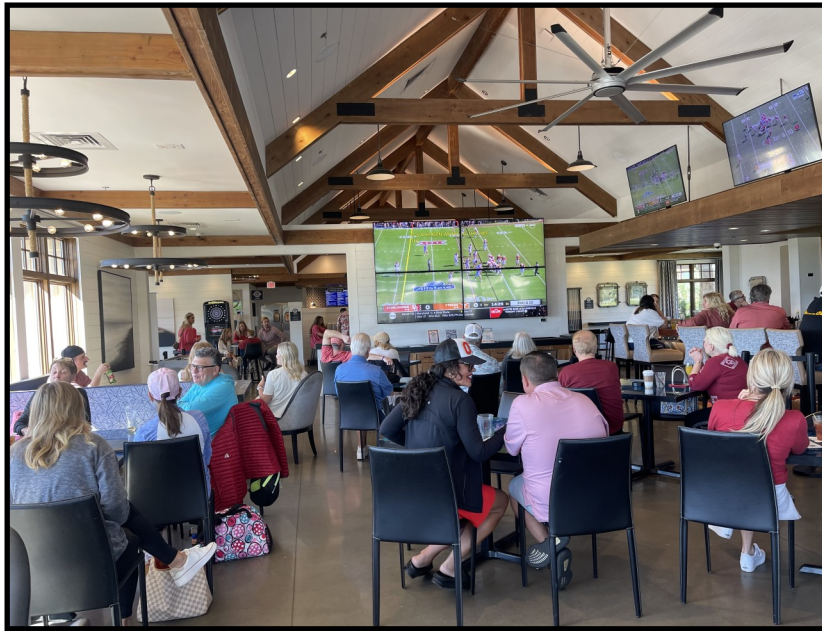
The Anchor is always the best place to catch your favorite sporting events. Don't forget the Bedlam Hooray Grill BBQ and Watch Party November 4.