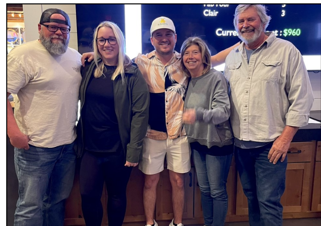
Over the past 12 weeks, The Beachcombers gave it their best efforts. It came down to the finish line where they finished in 2nd place in The Anchor's Tuesday Night Trivia.