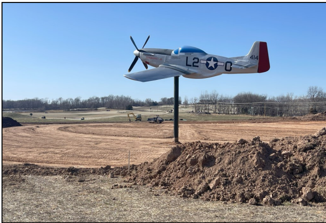
The "Legacy of Liberty" World War II Memorial park construction is underway at Shangri-La. The replica P-51 fighter is the first piece in place. Soon it will be joined by a variety of authentic World War II equipment as well as memorial monuments and statues honoring veterans of "The Greatest Generation."