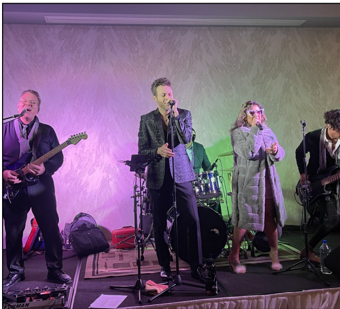
The fabulous show band "Hook" kept the crowd on the dance floor at the Shangri-La Valentine's in Black & White Gala!