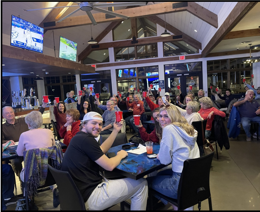
We had a fabulous turnout for our Tuesday Trivia event and Red Solo Cup tribute to Toby Keith.